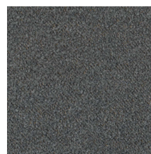
Paynes Grey 3623-803