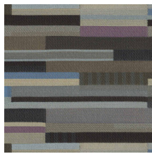
Cool Neutral 3942-801