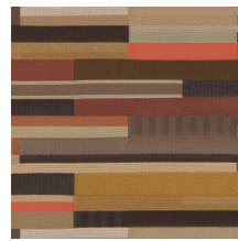
Pumpkin Cocoa 3942-903