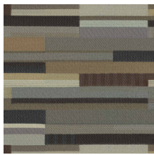
Warm Neutral 3942-101

Low VOC, No Antimicrobials, No Flame Retardants, No PFAS