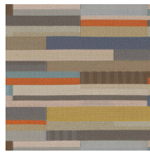
Cardamom Taupe 3942-901