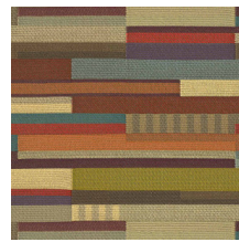
Mango Celery 3942-902