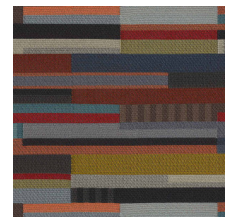
Bright Multi 3942-904